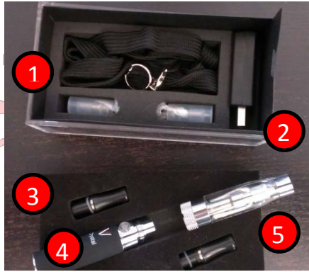
Figure 1 - Parts of an Electronic Cigarette

Your starter kit probably looks something like this: